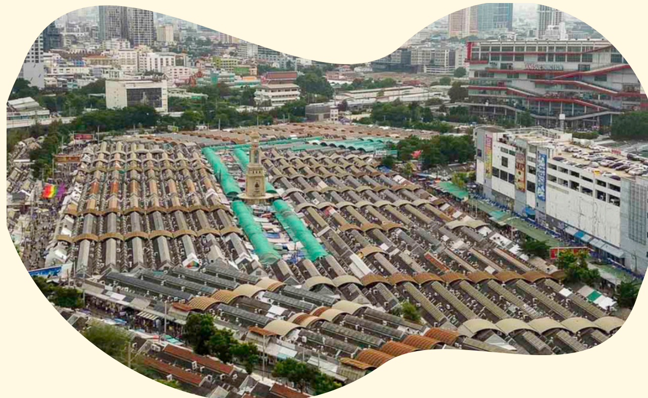
CHATUCHAK WEEKEND MARKET