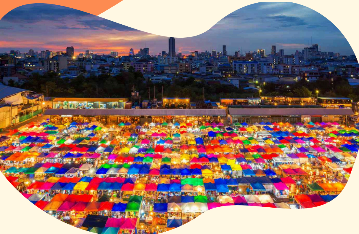
CHATUCHAK WEEKEND MARKET